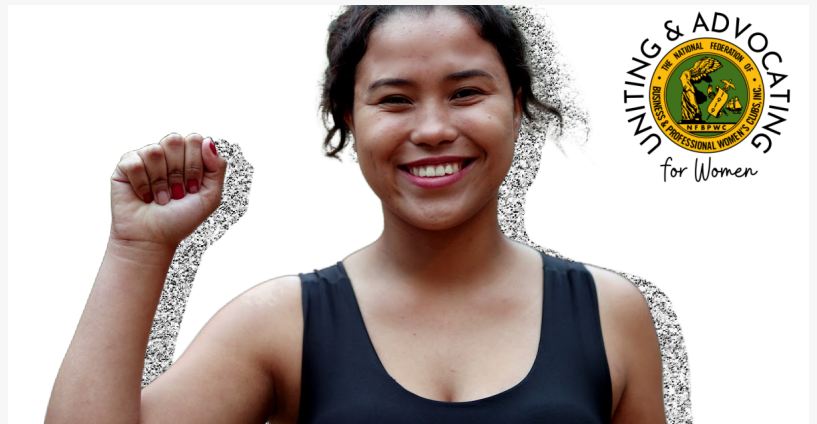
National Federation of Business and Professional Womens Clubs Uniting and Advocating for Women