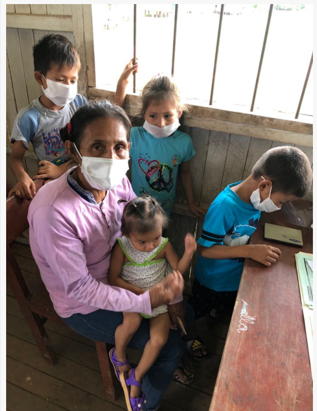
Children were promptly treated