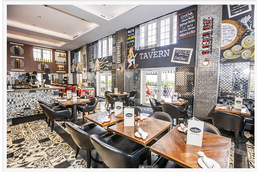
The Tavern

The Tavern, the on-site restaurant, serves a flavorful mash-up of fresh, zesty, crispy, or succulent dishes hand-picked by an award-winning chef. Open from 8:00AM to Midnight for breakfast, lunch, and dinner, the menu includes burgers, sandwiches, pastas, salads and much more. From shrimp tacos to the classic Cuban Sandwich, The Tavern has something for everyone's palette. Daily Free Happy Hour 6:00PM-7:00PM (vodka and gin only).