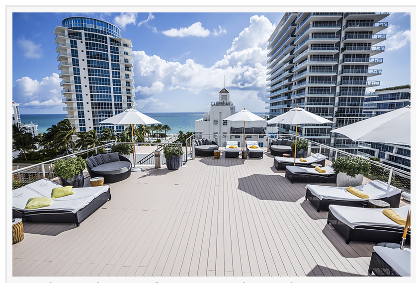
Hotel Croydon Roof Top

Hotel Croydon's guest rooms bring together luxury and relaxation. The Queen Room is a sophisticated and elegantly decorated retreat from a day at the beach or shopping nearby. Earthy tones, a luxurious cooling gel memory foam mattress, luxury C.O. Bigelow bath products, a fully stocked mini bar, a striking dark mahogany porcelain tile floor, an iHome docking