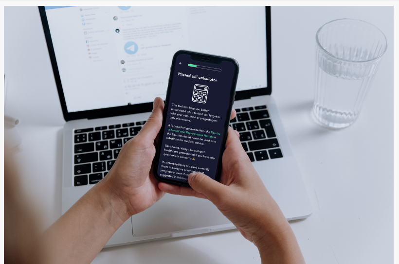
The world's first digital Missed Pill Calculator as launched by The Lowdown

LONDON, UNITED KINGDOM, January 24, 2022 /EINPresswire.com/ -- The Lowdown - the world's first review platform for contraception - has launched a one-of-a-kind digital missed pill calculator , aimed at removing the guesswork and minimizing risk of pregnancy for contraceptive pill users, answering the age-old question: "what should I do when I miss my pill?"