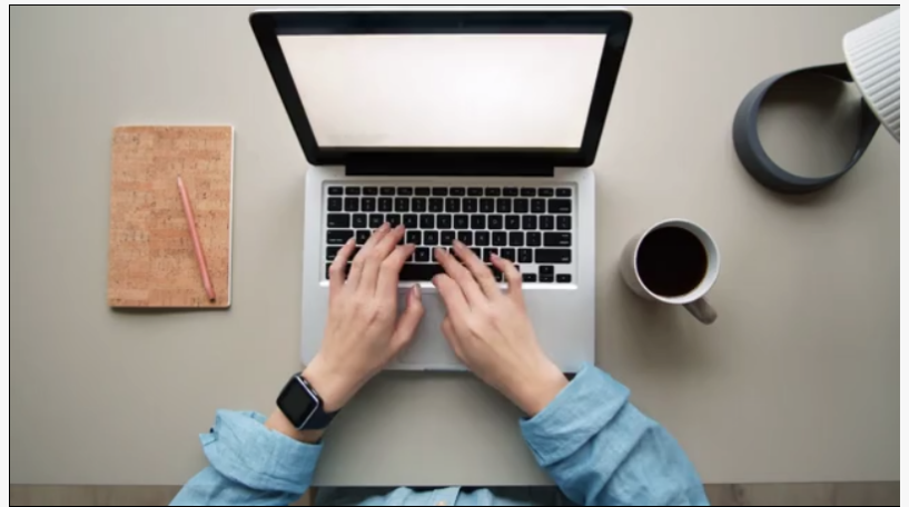
Frisco Health Insurance Agent