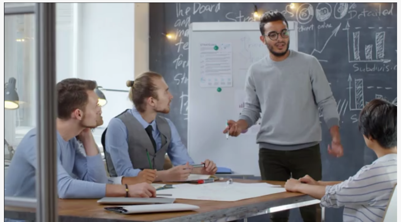
Group Health Insurance Frisco