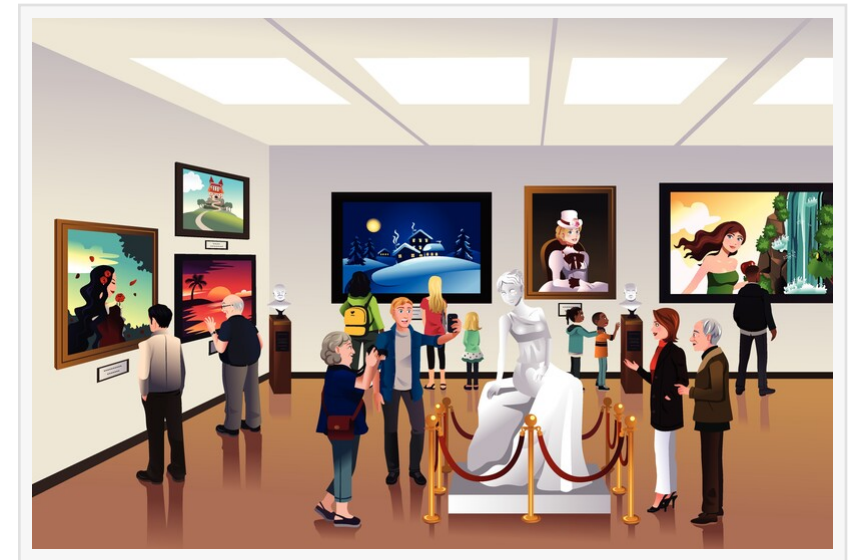
Life Without Boundaries

Recent developments in automatic language translation AI software allows all communication to be automatically translated into the user's native language whether written or spoken. In other words, a French speaking person will be able to speak with a Hindi person because both user's headset will automatically translate their communication into their own language. A person from Argentina in the Spectruth's virtual shopping mall and virtual kiosk hall will see all the signs and advertisements in Spanish