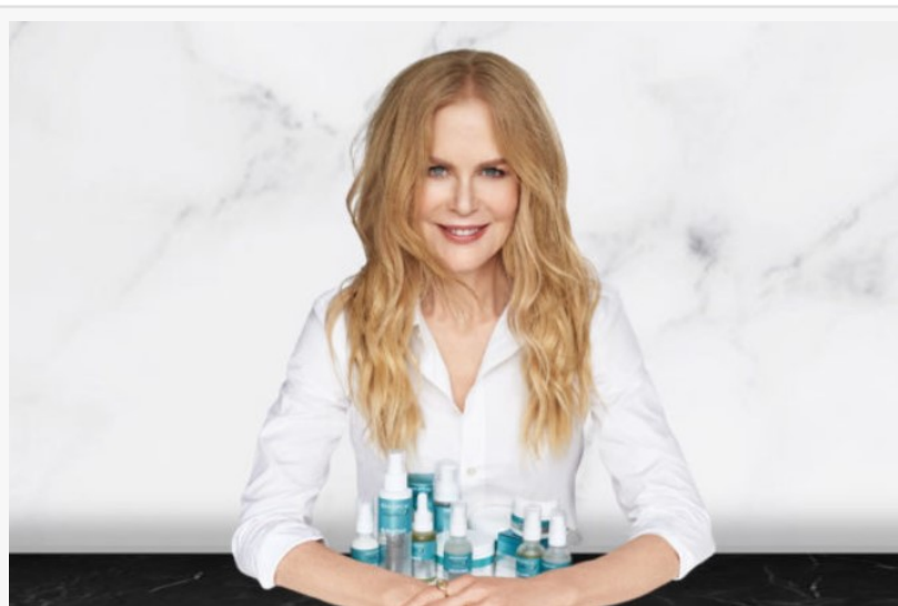
CURR & Nicole Kidman

CURR is the pioneering developer of CUREform™, a patented drug delivery platform that offers a number of unique immediate-release and controlled-release drug delivery technologies designed to improve drug efficacy, safety, and patient experience for a wide range of active ingredients. CURR delivery technologies include CUREfilm®, an advanced oral thin film; and CUREdrops™, an emulsion technology that can be incorporated into different dosage forms (film, tincture, beverages, etc.), among others. The CURR proprietary clinical pipeline includes CUREfilm®Blue (sildenafil to treat erectile dysfunction), and CUREfilm®Canna (THC and CBD).