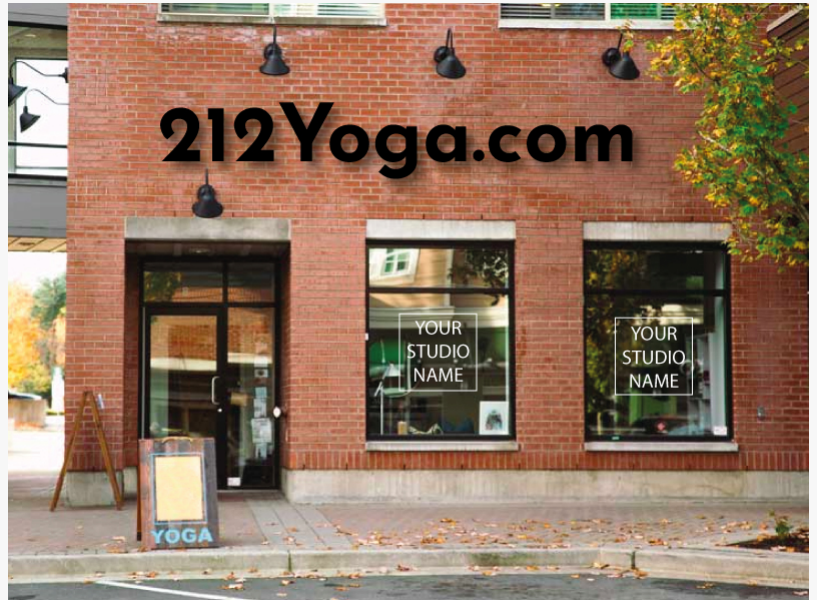
Get More Customers For Your Business