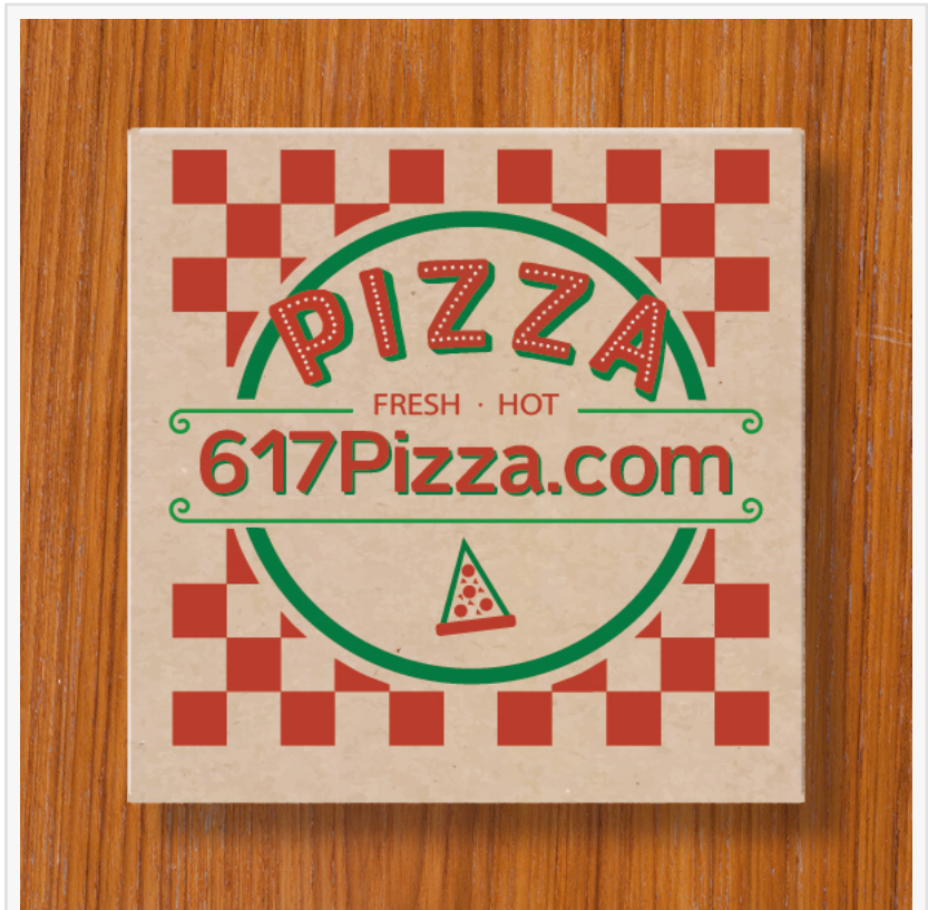
Get More Customers For Your Business

With so many digital marketing opportunities available today, business owners can become overwhelmed and miss easy opportunities to improve their sales. Area Code Domains positions itself as a helpful resource to guide that process, beginning with their foundational strategy of owning a location-based website domain name that is memorable and marketable across a wide