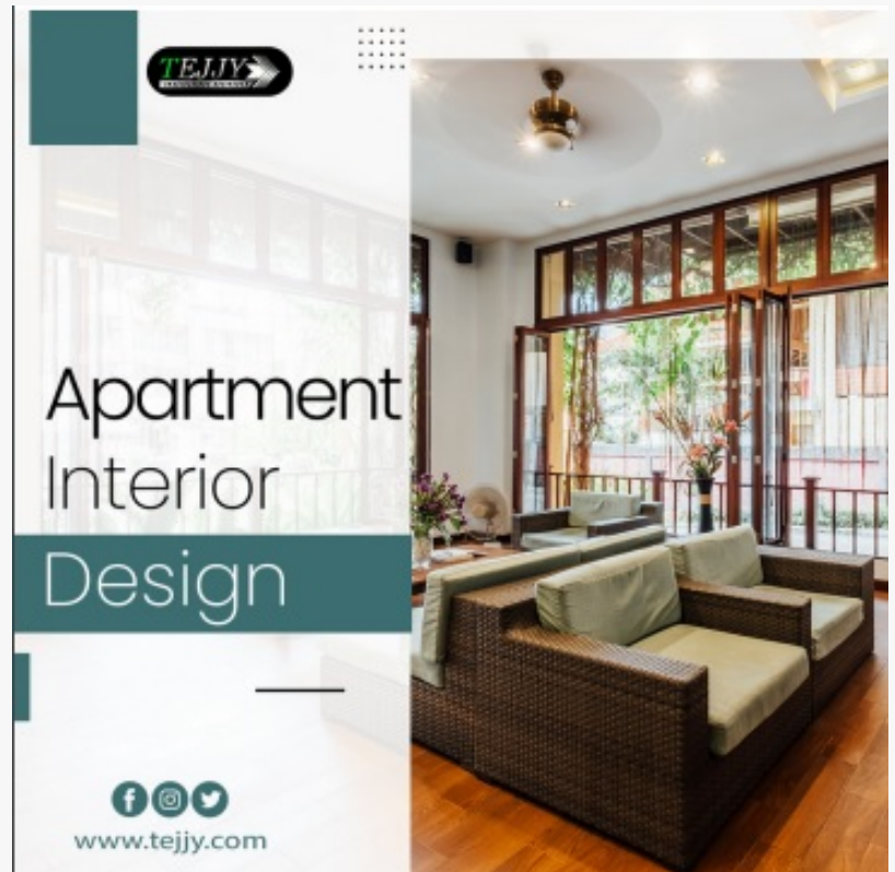
Interior Design of an Apartment