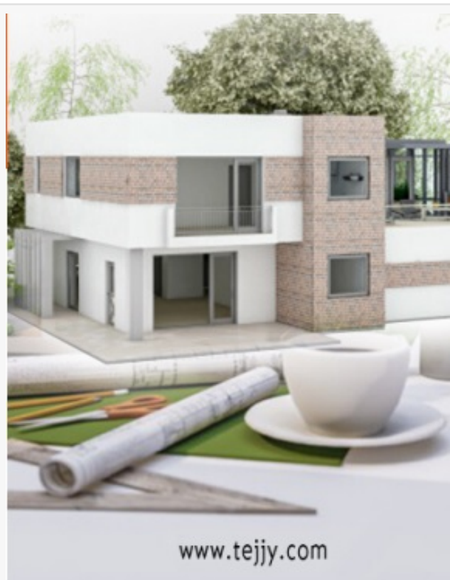
Customized Deliverables of Tejy Inc.