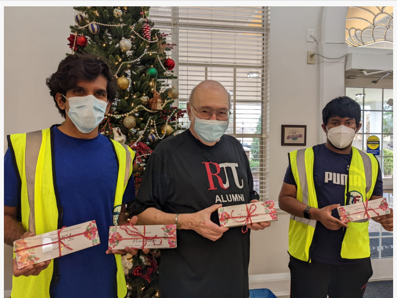
Zakat Foundation of America representative present Altenew's donation of watercolor pan sets to senior centers and assisted living centers in North Carolina.

frontline workers, and other noteworthy causes. Proceeds from the sales of these products have gone to directly support these causes. Honoring seniors has always been a top Altenew priority ever since its inception in 2014. The company hosts an annual parent card drive , mobilizing paper crafters all across the country to send in handmade cards to distribute to senior centers and assisted living facilities. Altenew incentivizes crafters by offering giveaway prizes and social media publicity. However, sharing handmade crafty love with others is a common passion that the majority of Altenew customers share and they willingly send hundreds, if not thousands, of handmade cards every year.