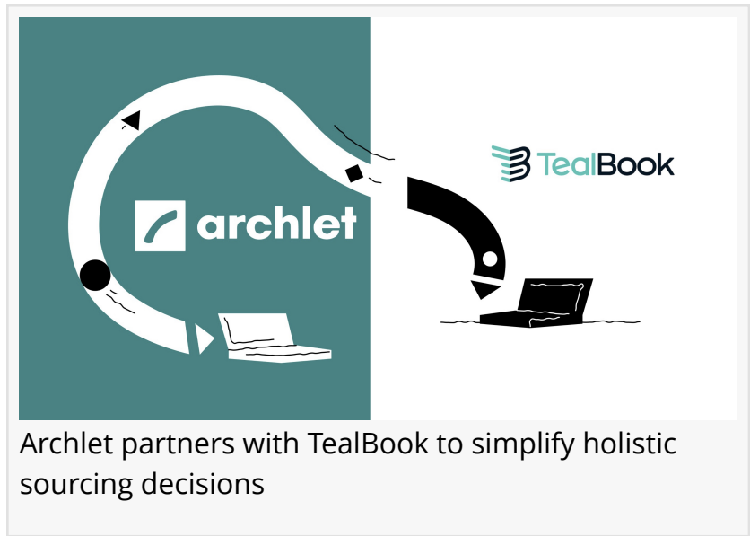
Archlet partners with TealBook to simplify holistic sourcing decisions

ZÜRICH, SWITZERLAND, January 25, 2022 /EINPresswire.com/ -- TealBook, the leading supplier data foundation that autonomously enhances supplier data and powers e-procurement technology, and Archlet, the user-first sourcing software company that helps companies make better sourcing decisions faster, today announced a new partnership to make third-party supplier information directly available in the creation of sourcing scenarios within Archlet.