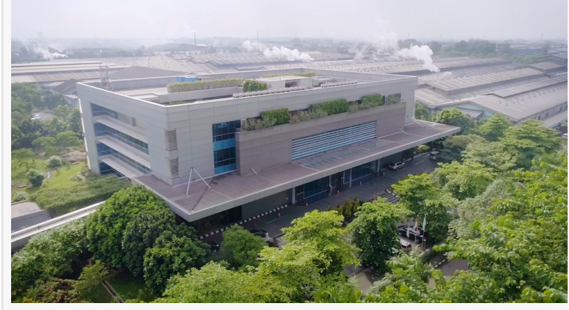
PT Gajah Tunggal Tbk, the largest integrated tire manufacturer in Southeast Asia

The Company supports the United Nations Sustainable Development