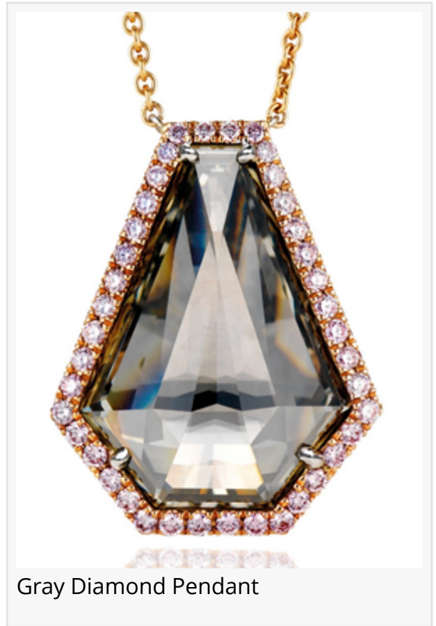
Gray Diamond Pendant