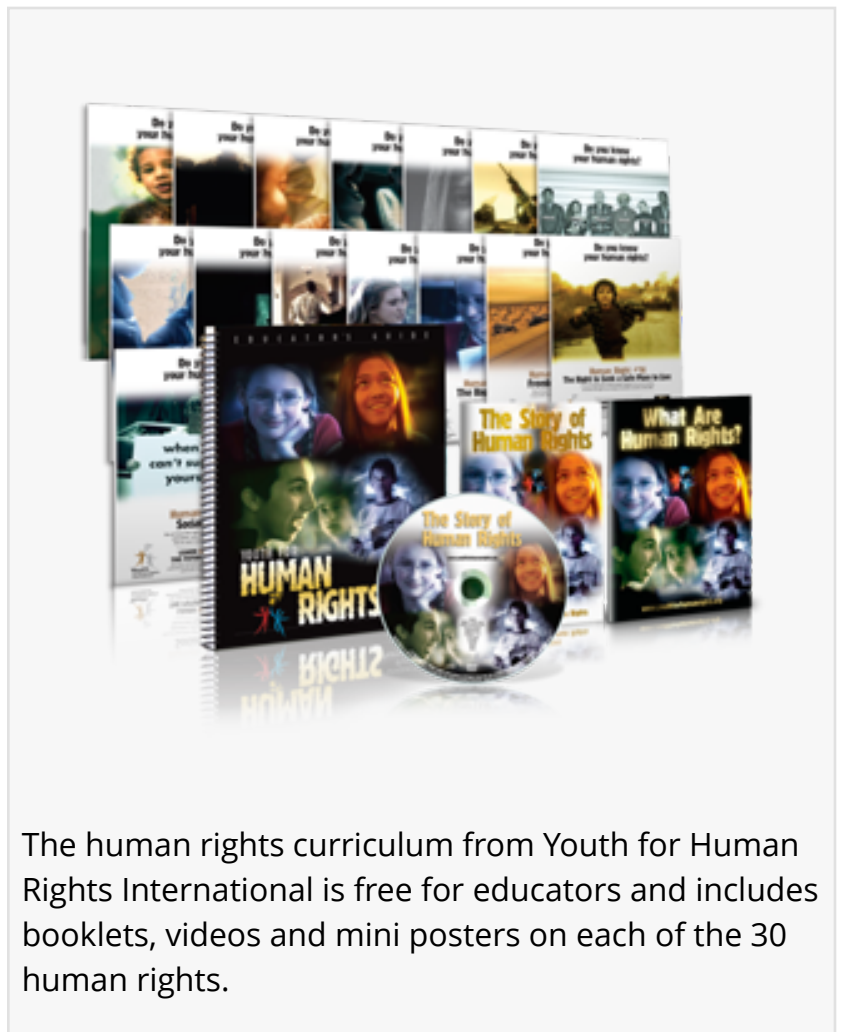
The human rights curriculum from Youth for Human Rights International is free for educators and includes booklets, videos and mini posters on each of the 30 human rights.

Youth for Human Rights International (YHRI) is a nonprofit organization whose mission is to teach youth about human rights, specifically the United Nations Universal Declaration of Human Rights, and to inspire them to become valuable advocates for tolerance and peace. YHRI advocates for human rights both in the classroom and in nontraditional educational settings such as through art series, concerts and other interactive community events, including regional and international human rights summits which bring youth together from across whole sectors of the world. Their most recent campaign has included #KnowYour30 with the deliberate purpose of increasing awareness of the 30 human rights every person has - and how they are a part of everyday life. To learn more about human rights go to