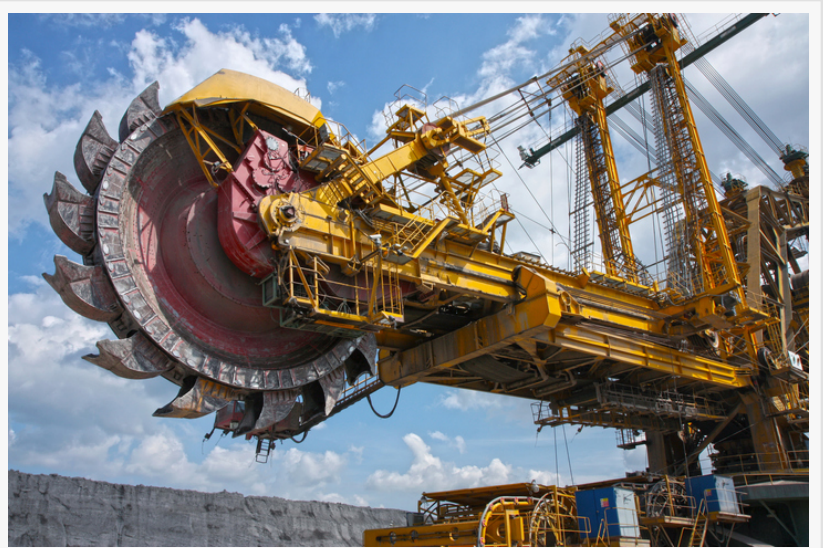
Used Mining Equipment

This press release can be viewed online at: https://www.einpresswire.com/article/561699816