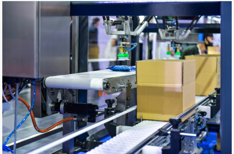
Used Packaging Equipment