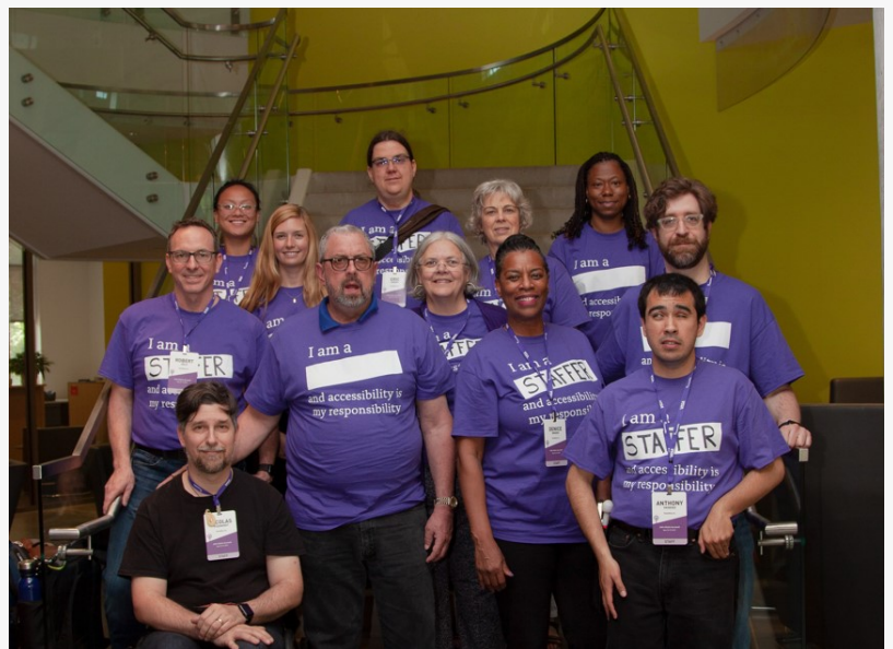
Knowbility staff gather for a group photo at AccessU 2019