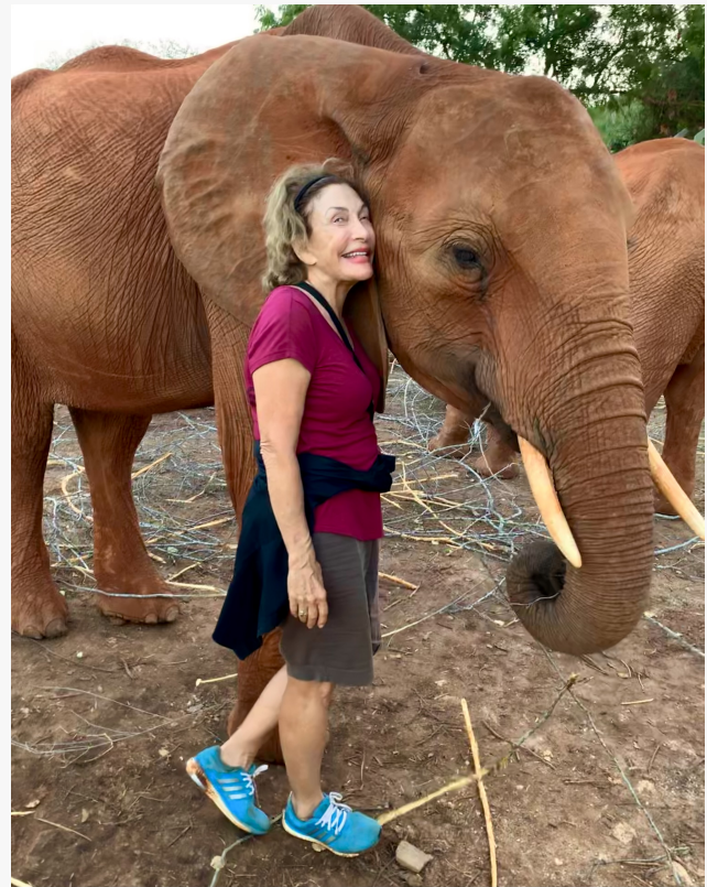
The author with a friend