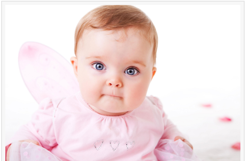
Fertility Image 2

This press release can be viewed online at: https://www.einpresswire.com/article/561776828