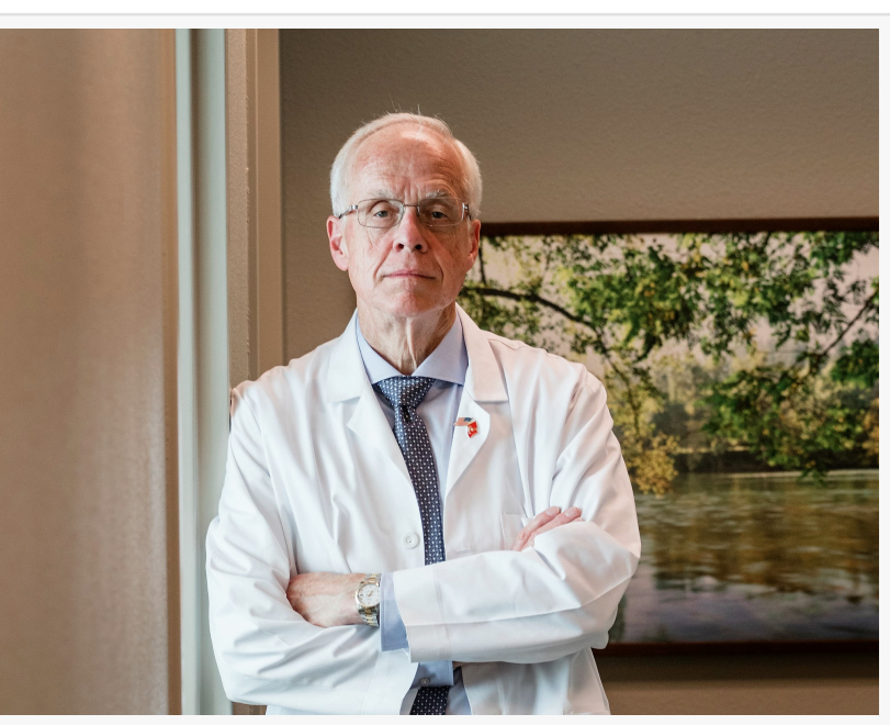
Bud Pierce, MD, Candidate for Oregon Governor

The school district announced it would make masks optional in classrooms.