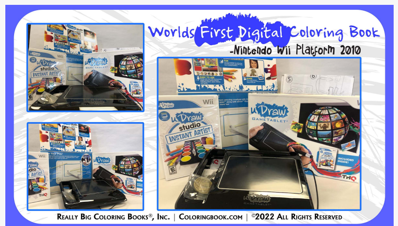
Wii platform, the worlds debut digital coloring book in 2010