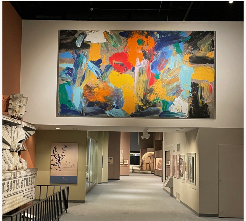
Cluffalo: Art Omi, 2017, latex on canvas, 108 x 192 inches, NY State Museum, Albany