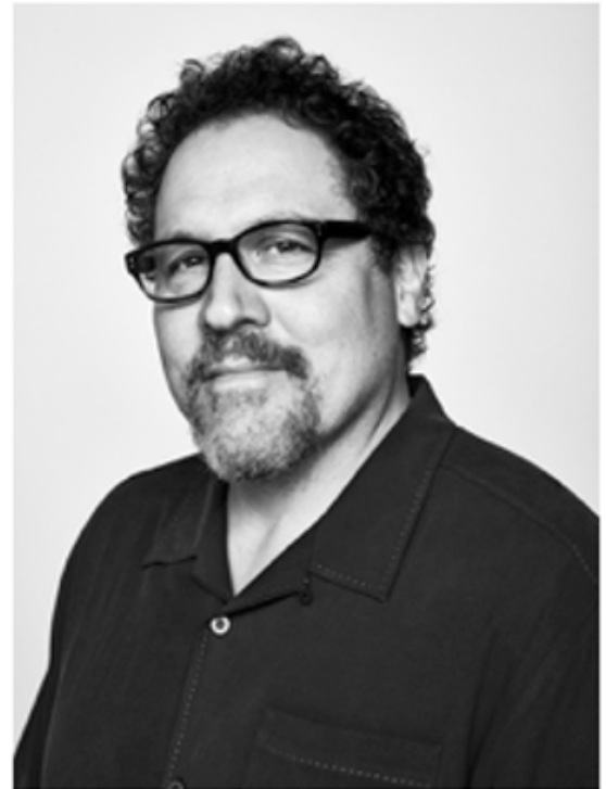
Jon Favreau

Presenting Jon Favreau with the Distinguished Artisan Award is Ming-Na Wen, who herself has an impressive body of work across television and film. She is currently the star in "The Book of Boba