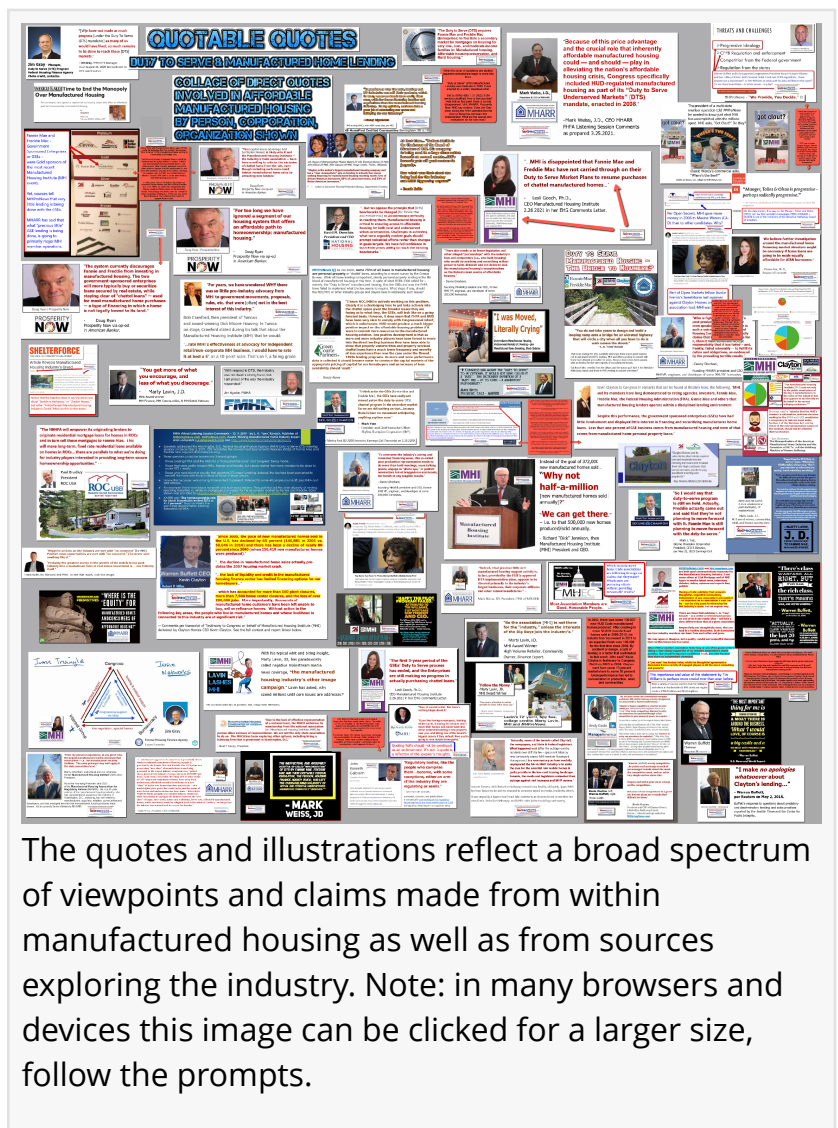
The quotes and illustrations reflect a broad spectrum of viewpoints and claims made from within manufactured housing as well as from sources exploring the industry. Note: in many browsers and devices this image can be clicked for a larger size, follow the prompts.