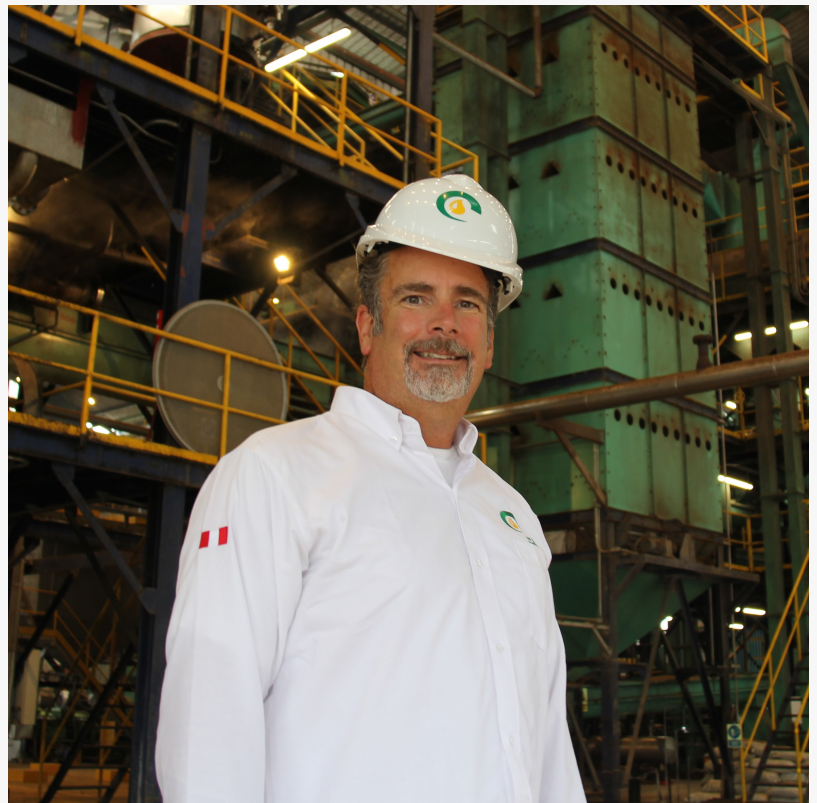
We are not expanding crops and we take great care of the fauna and flora around us.