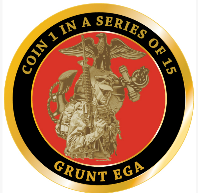
Coin 1 in a series of 15 by artist Dick Kramer