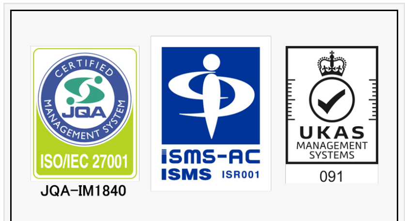
ISMS Associated Logos

In March 2019, BuyChemJapan set a concrete business strategy aimed at realizing its corporate mission of “deepening mutual understanding and bridge the gap between Japan and the rest of the world” and its vision of “using technology to increase the level of communication between Japan and the rest of the world.” Two and a half years after establishment, BuyChemJapan Corporation has developed an online marketplace which acts as tool for providing international buyers with one-on-one access with Japanese chemical manufacturers and offers complete digitization of the process of buying Japanese chemicals from abroad. Due to being in the key position of handling important confidential information related to marketplace users, BuyChemJapan Corporation has taken all possible measures for information security and, as proof of this, and to instil trust in its business partners and customers, the company has acquired ISMS certifications; ISMS