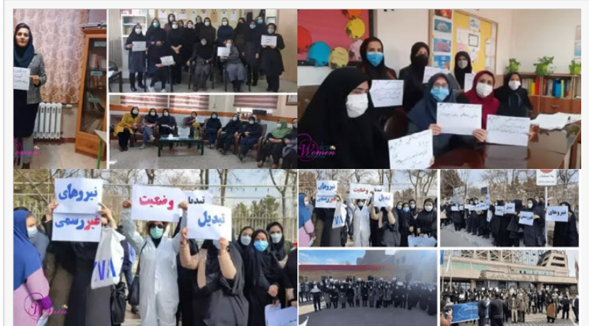
Teachers demonstrated for the third day in a row in protest of their unbearable living conditions, low salaries, and disregard for their demands in 120 cities in Iran on Monday, January 31, 2022.

Another primary demand of the teachers' demonstrations was the release of imprisoned teachers. Women teachers played a passionate and prominent role in all the protests.