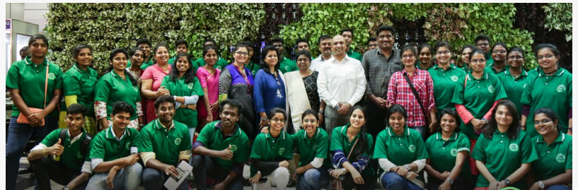
UV Gullas College of Medicine Airport Send off