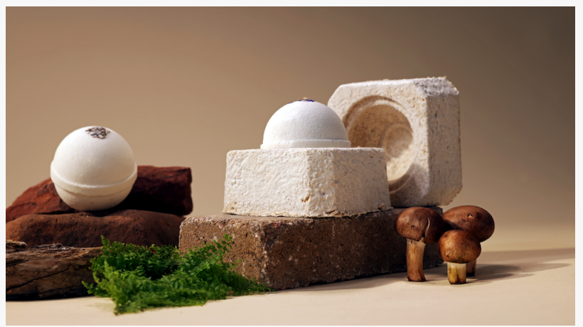
Naked CBD Bathbombs + Mushroom® Packaging = Zero Waste Perfection

Mushroom® Packaging is considered an ecological alternative to plastic, containing just two ingredients...Mycelium and hemp hurds. MycoCompsite™ technology takes mycelium, the vegetative body for fungi that produce mushrooms, and introduces it to hemp hurds to grow a fine structured web in 6 days before it is prepared as a biodegradable, fully home-compostable packaging resource.