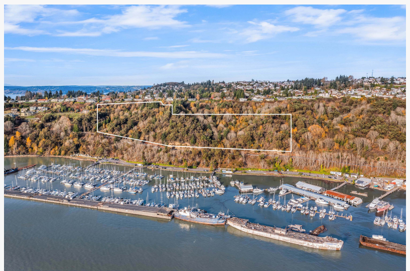
Rare development opportunity

opportunities. Agents earn their commission in 30 days. In November 2021, Concierge Auctions was acquired by Sotheby's, the world's premier destination for fine art and luxury goods, and Realogy Holdings Corp., the largest full-service residential real estate services company in the United States, holding a joint 80 percent ownership stake. Concierge Auctions continues to operate independently, partnering with real estate agents affiliated with many of the industry's leading brokerages to host luxury auctions for clients. Since Concierge Auctions' inception in 2008, it has generated billions of dollars in sales, broken world records for the highest-priced homes ever sold at auction and conducted auctions in 46 U.S. states and 30 countries. The firm owns one of the most comprehensive and intelligent databases of high-net-worth real estate buyers and sellers in the industry, and it has committed to build more than 300 homes through its Key For Key® giving program in partnership with Giveback Homes™, which guarantees that for every property the company sells, a new home is funded for a family in need. For more information, visit ConciergeAuctions.com .