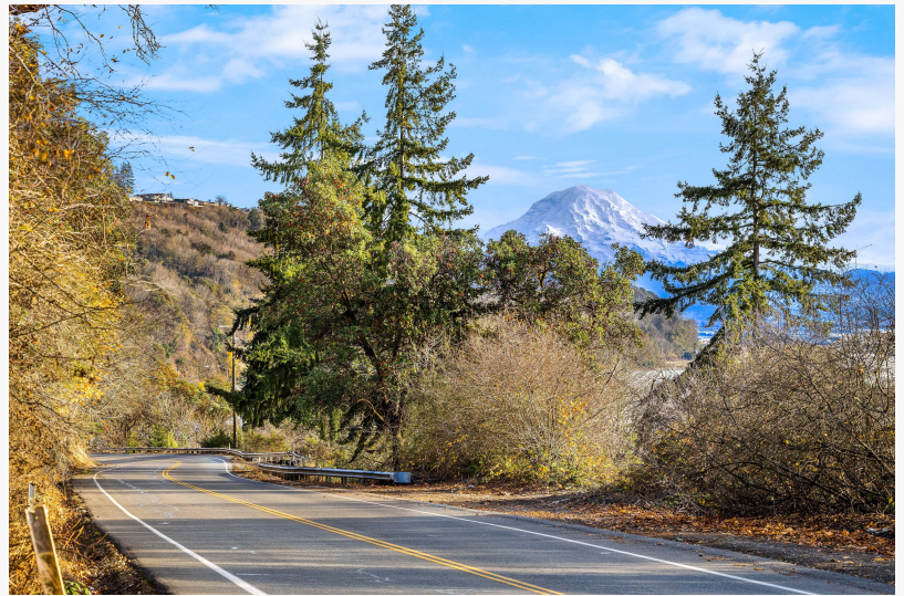
Surrounded with natural beauty and a thriving community

Concierge Auctions offers a commission to the buyers' representing real estate agents. See Auction Terms and Conditions for full details. For more information, including property details, exclusive