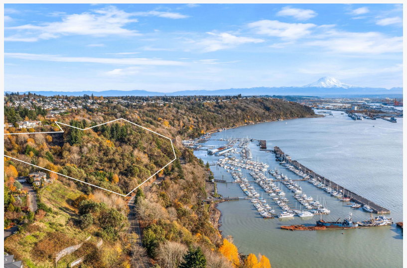
27± acres in Tacoma with incredible waterfront views

/EINPresswire.com/ -- Surrounded by incredible waterfront views, 5801 Marine View Drive will auction this month via Concierge Auctions in cooperation with Ned Hosford and Bob Bennion of Compass Washington. Currently listed for $5 million, the property will sell No Reserve to the highest bidder regardless of the price. Bidding is scheduled to be held on February 24–28 via Concierge Auctions' online marketplace, ConciergeAuctions.com , allowing buyers to bid digitally from anywhere in the world.