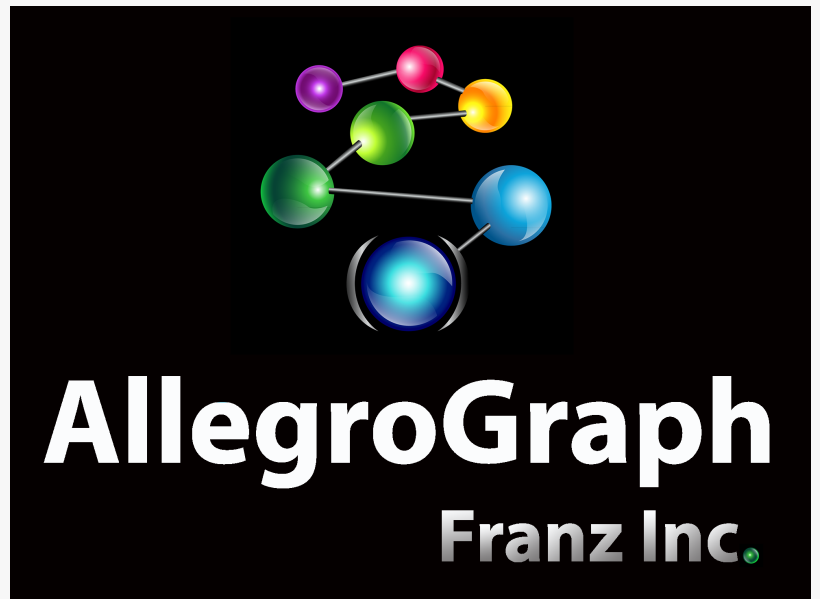
AllegroGraph - Franz Inc.

LAFAYETTE, CALIFORNIA, USA, February 2, 2022 /EINPresswire.com/ -- Franz Inc. , an early innovator in Artificial Intelligence (AI) and leading supplier of Graph Database technology for Entity-Event Knowledge Graph Solutions, today announced Gruff 8.1, an advanced knowledge graph visualization software tool that can be embedded in any web page or web application. Users can now visually build queries and visualize connections between enterprise data directly within a web page or web application, enabling a simple and seamless knowledge discovery experience.