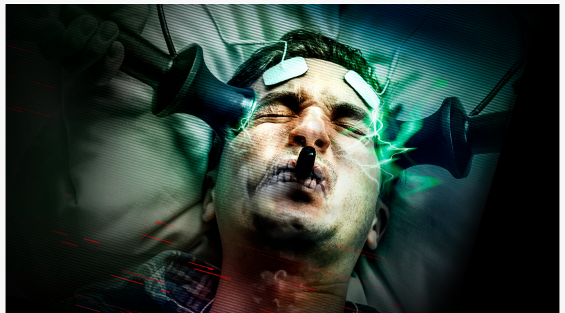
ECT sends up to 460 volts of electricity through the brain in order to induce a grand mal seizure.