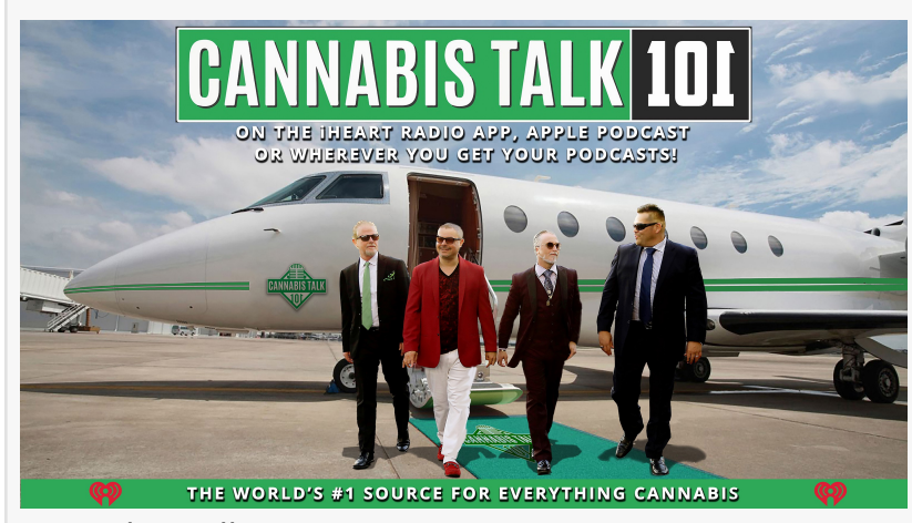
Cannabis Talk 101

http://cannamanagementgroup.com/ Presents Live Performances by: