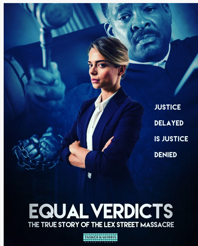
Equal Verdicts Movie