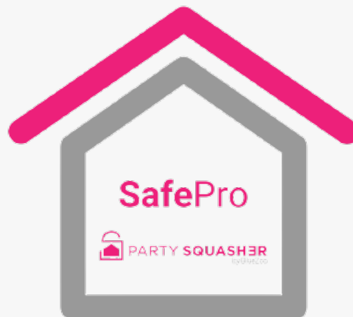
Party Squasher SafePro logo

Party Squasher products are dedicated to protecting properties, hosts, and guests in the short-term rental ecosystem. Party Squasher is a product family from Wi-Fi innovator BlueZoo Inc, a Silicon Valley-based technology company that delivers foot traffic analytics products, including occupancy measurement. BlueZoo's other product families deliver solutions to the insurance,