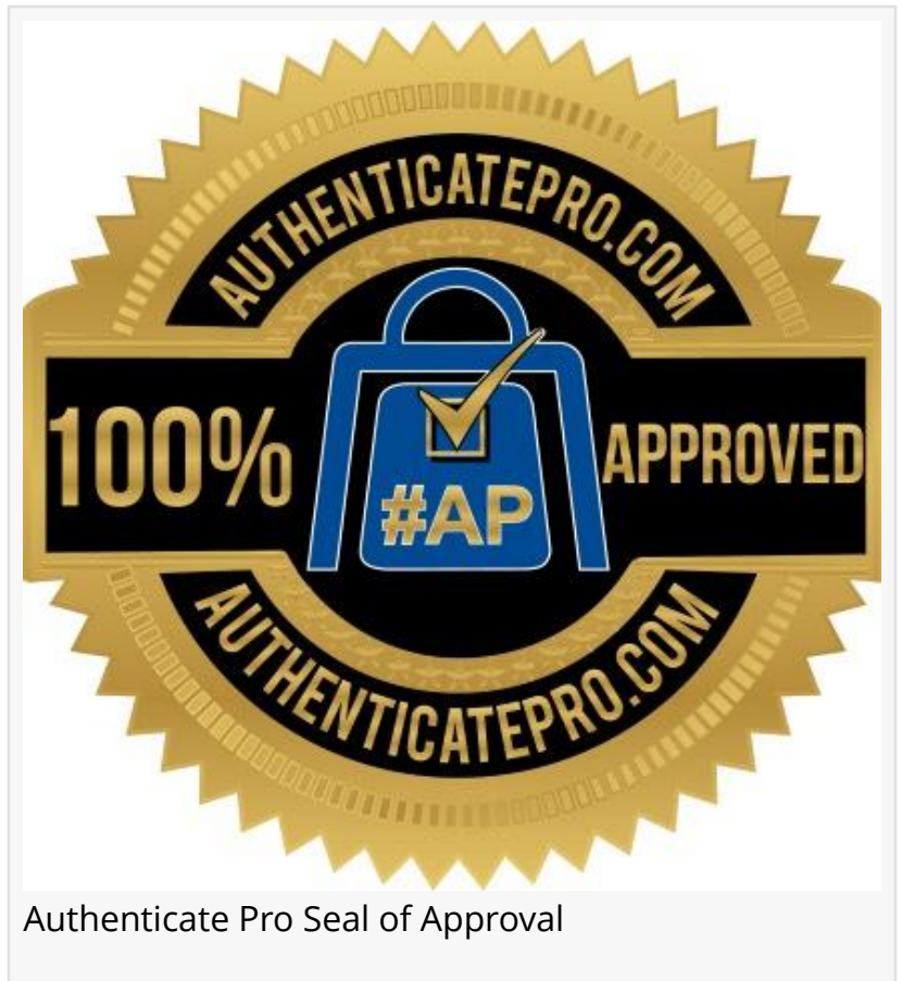
Authenticate Pro Seal of Approval

This press release can be viewed online at: https://www.einpresswire.com/article/562203487