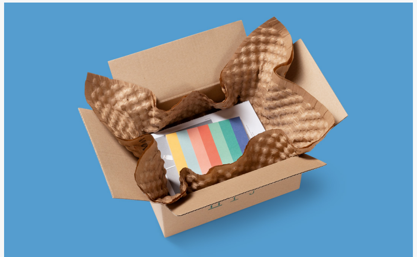
PAPERbubble® protective packaging is an ideal alternative to plastics-based void fill.

Crownhill Packaging is one of the first companies in North America able to offer this eco- and