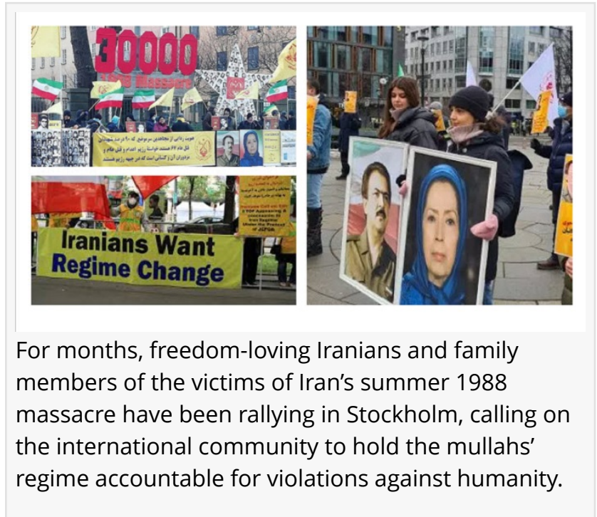
For months, freedom-loving Iranians and family members of the victims of Iran's summer 1988 massacre have been rallying in Stockholm, calling on the international community to hold the mullahs' regime accountable for violations against humanity.

PARIS, FRANCE, February 3, 2022 /EINPresswire.com/ -- For months, freedom-loving Iranians and family members of the victims of Iran's summer 1988 massacre have been rallying in Stockholm, calling on the international community to hold the mullahs' regime accountable for their human rights violations and crimes against humanity.