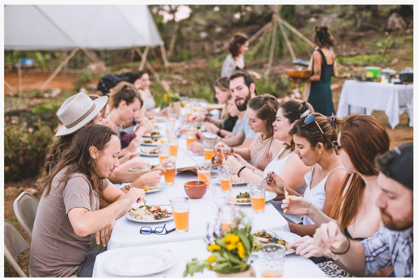
Alegria Village Community

Well renowned communities known in Costa Rica for their ecological impact, communal areas and overall community living include Oro Monte , Altos de Antigua, Alegria Village and Yoko Village . These community-driven developments portray the ideal synergy between the natural surroundings of tropical forests and vegetation with well established modern housing.