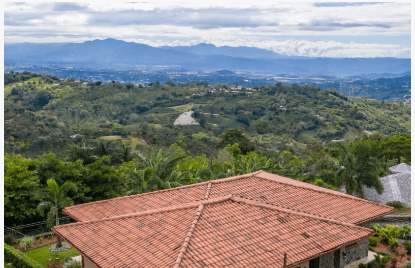
Oro Monte Central Valley Views

The development of Costa Rican communities has seen an uprise in popularity for foreigners and ex-pats throughout the past couple of years. These vivid communities all around this tropical paradise bring many benefits to individuals such as boosts in physical & mental health and the phycological effect of never being alone.