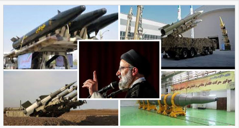
Turning a blind eye on the Iranian regime's terrorism and its human rights violations are emboldening Tehran to expand its rogue behavior across the Middle East and create even more mayhem throughout the region.