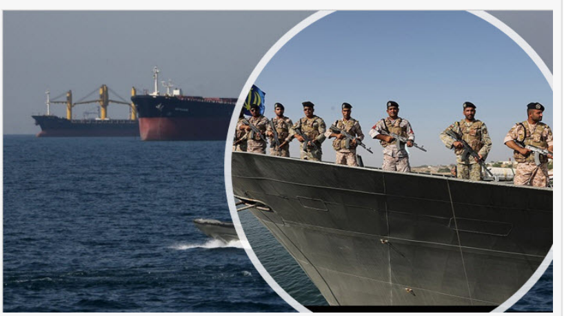
One stark example of the uptick in Tehran's naval terrorism is the growing capabilities of the Houthis in Yemen. The IRGC Quds Force has provided them with speedboats, missiles, mines, and other weapons.

The Quds Force has also allocated several Persian Gulf islands, including Farur and Qeshm, to the training of the maritime terror cells. The islands are hosting training complexes, weapons, missiles, controlled by the IRGC Navy and the Quds Force.