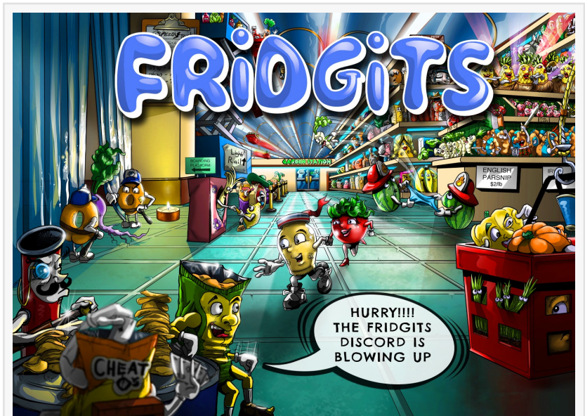
Fridgits Preview NFT Image, a food-based NFT Project with 20 Individual Ingredient-Illustrated Characters