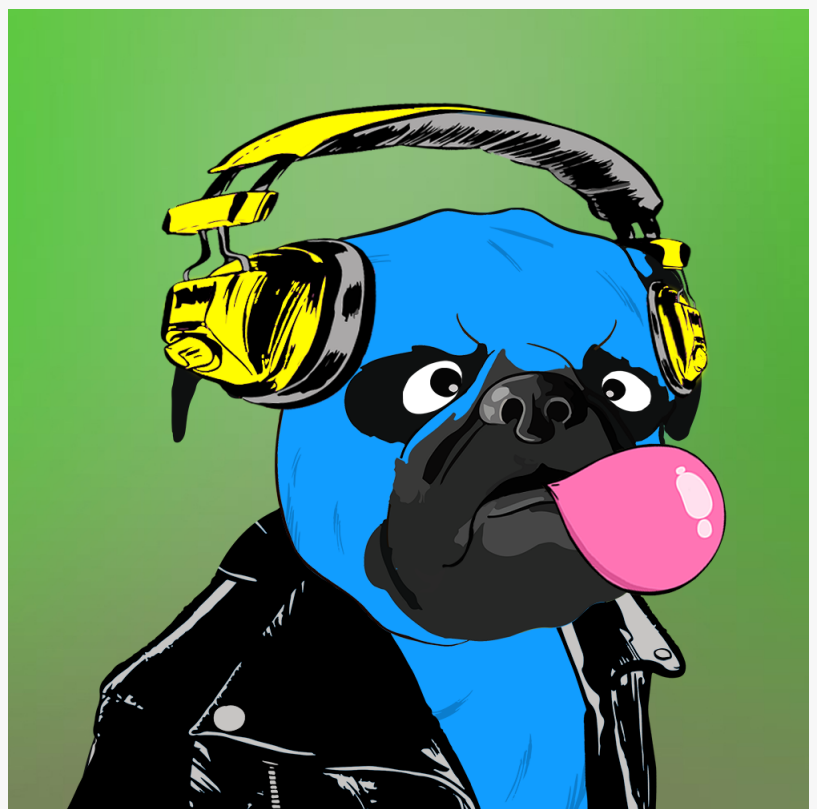
Grumpy Pug #2697

/EINPresswire.com/ -- METANAV , a future platform for fully immersive experiences in the tourism industry, today announced their partnership with The Grumpy Pugs NFT brands to design and develop a social commerce platform, also known as a Metaverse, for the Grumpy Pugs NFT community which will be an advancement in virtual worlds where friends, family, businesses can interact, play, shop, purchase fashion, art, even land, homes, and automobiles. A true play-to-earn environment, where participants are rewarded with digital assets and cryptocurrency while in the Grumpy Pugs Metaverse.