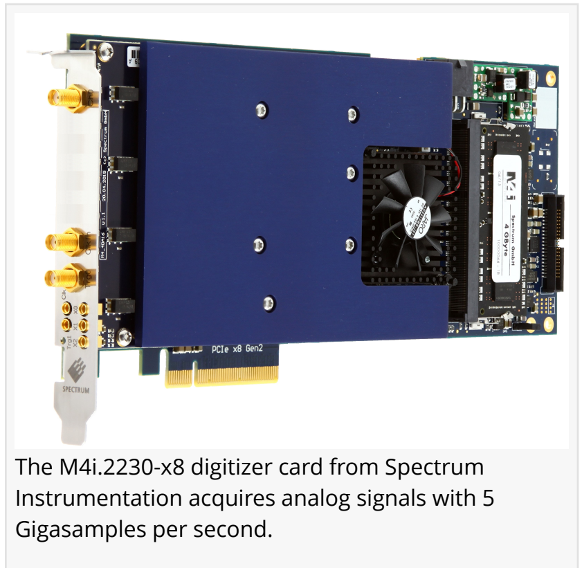
The M4i.2230-x8 digitizer card from Spectrum Instrumentation acquires analog signals with 5 Gigasamples per second.

Sven Harnisch Spectrum Instrumentation +49 4102 69560 email us here