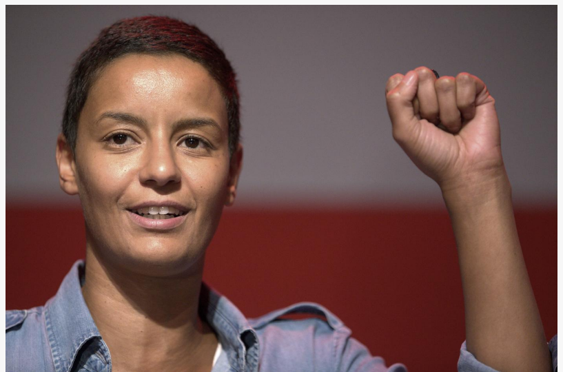
Belgian Minister of Development Cooperation Meryame Kitir

"For these reasons, the Belgian public will be deeply concerned that minister Meryame Kitir