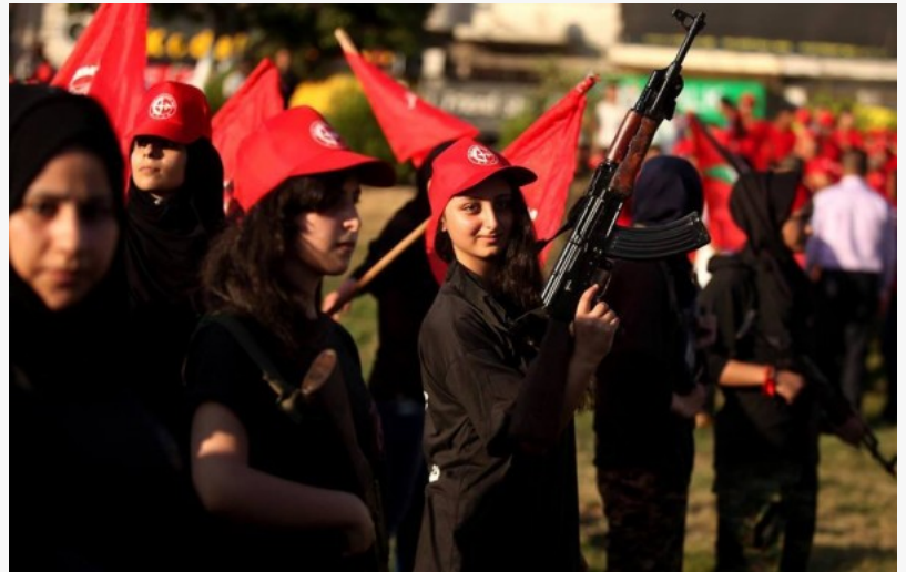
Girls attending a PFLP 'summer camp' in Gaza.

BRUSSELS, BELGIUM, February 7, 2022 /EINPresswire.com/ -- According to the Coalition to save Palestinian Child Soldiers Coalition (CPCS), whose annual awareness campaign takes place this week (February 7 - 13th), "The ruling power of the Gaza Strip, the terrorist organisation Hamas, has child training camps in which it trains children as auxiliaries and militia members. Approximately 10,000 children and teens are trained each year with terrorist "summer camps" which are grueling basic training boot camps. There, children learn combat manoeuvres, weapon operation, and terrorist tactics."