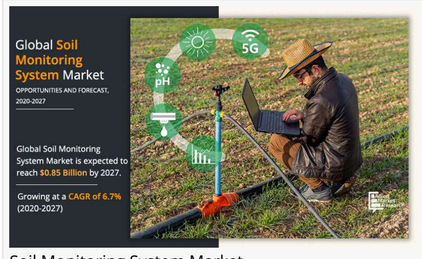
Soil Monitoring System Market

PORTLAND, OREGON, UNITED STATES, February 7, 2022 /EINPresswire.com/ --Soil Monitoring System Market Advancement, Growth Prospects, Target Audience, and Segmentation | Covid-19 Impact Analysis