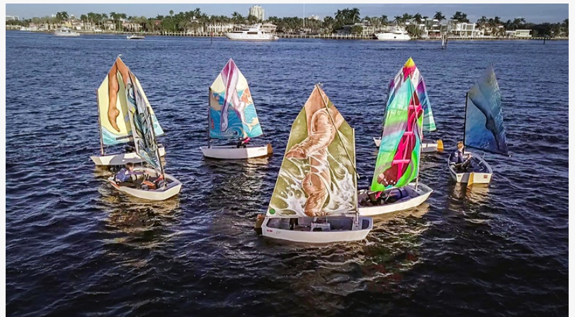
Street Art Regatta