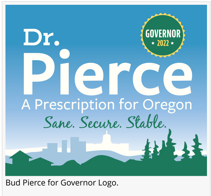
Bud Pierce for Governor Logo.

and it's making people angry," he added.