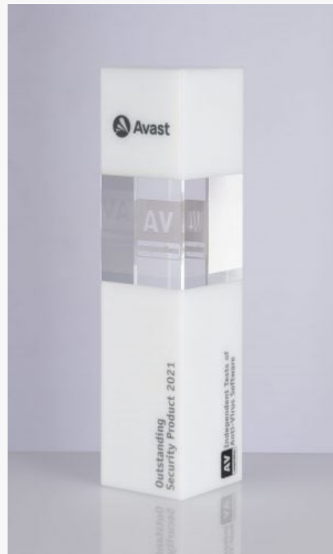
Avast Outstanding Security Product Trophy 2021