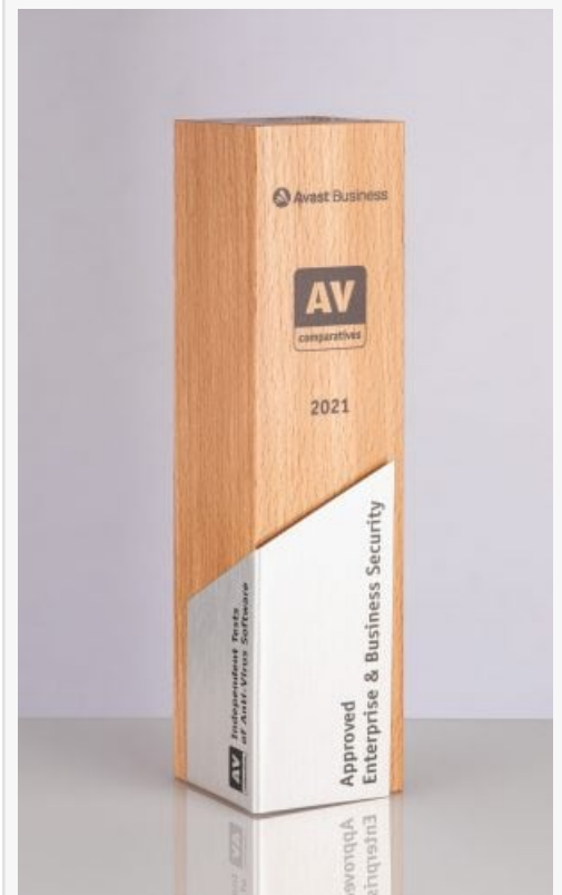
Avast Approved Enterprise & Business Security Trophy 2021