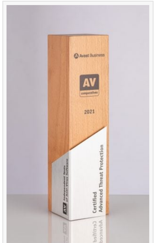
Avast Certified Advanced Threat Protection Trophy 2021