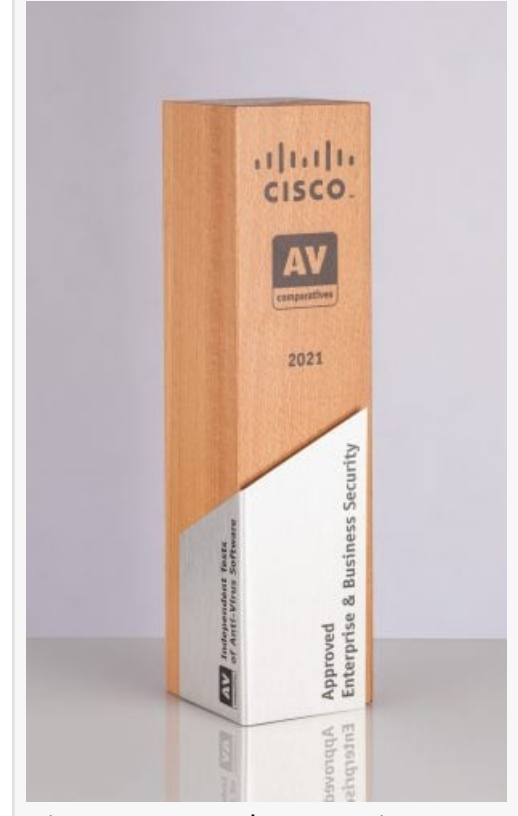
Cisco Approved Enterprise & Business Security Trophy 2021