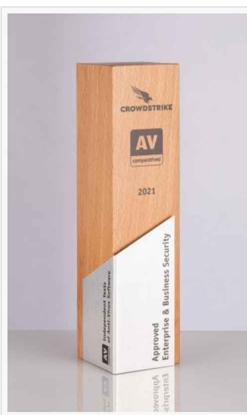
CrowdStrike Approved Enterprise & Business Security Trophy 2021