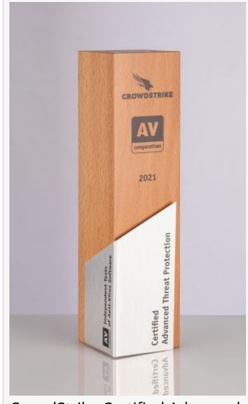
CrowdStrike Certified Advanced Threat Protection Trophy 2021