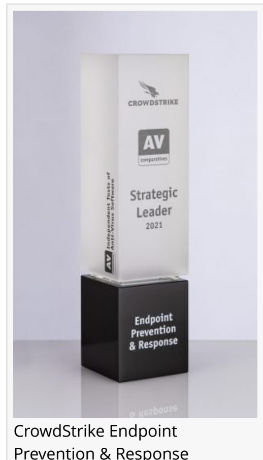
Prevention & Response Strategic Leader Trophy 2021

CrowdStrike Falcon Pro participated very successfully in AV-Comparatives' enterprise tests of 2021. These covered different protection scenarios, low false positives, low impact on system performance and protection against advanced threats, along with endpoint prevention and response capabilities.